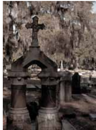
Live Oak Cemetery, Selma, Alabama