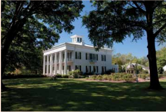
Sturdivant Hall: Selma, Alabama

Many resources are available at the following websites: www.alabamafrontporches.com www.blackbelttreasures.com www.cahawba.com www.holmesteadcompany.com www.selmaalabama.com