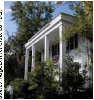
Gaines Ridge Dinner Club, Camden

and if he was okay, the rider would come on a white horse. A rider mistakenly arrived on a black horse and the wife committed suicide by jumping from the tower at the top of the house.