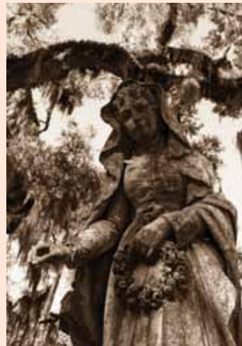
Live Oak Cemetery, Selma, Alabama

The Purefoy House: This house, located in Furman, involves a well where a slave was reportedly buried alive. The story is told in 13 Alabama Ghosts . It is a private residence for driving tour only. N32°00'17.5"W086°58'17.2"